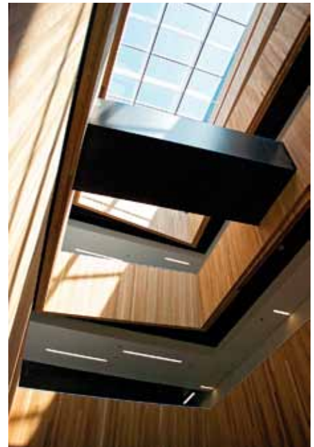
UBC's Pharmaceutical Sciences Building required GHL's alternative solutions approach to reach acceptable levels of fire safety.

Even something as seemingly innocuous as an architect wanting stairwell glass to be sloped instead of vertical can be a huge impediment in achieving code compliance. Such was the case with the Electronic Arts